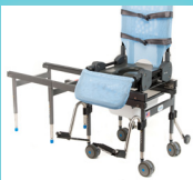
Compact Transfer Base