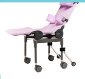
Attached Rolling Base