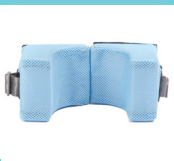
Lateral Support Pads