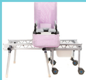
Foldable Transfer Base