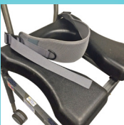
Rapid Dry Positioning Belt