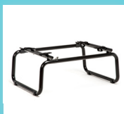
Det. Extension Base