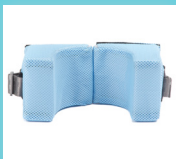
Lateral Support Pads