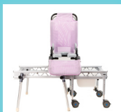
Foldable Transfer Base