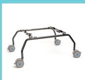
Det. Rolling Base