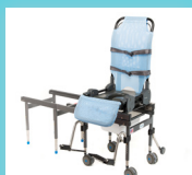
Compact Transfer Base