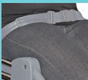
Pelvic Positioning Belt