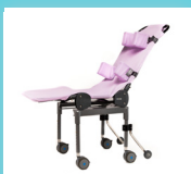
Attached Rolling Base