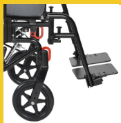
70° Footrests, Adjustable Angle Footplates