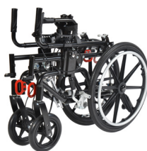
Folds for Easy Transport

The Kanga™ Adult Wheelchair is ideal for anyone who requires adjustability in the tilt-in-space market, whether in an adult rehab, capped rental or long term care setting.