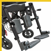
Adult Elevating Legrests