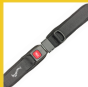
Padded Center Pull Pelvic Belt