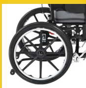
12" Rear Wheel Assembly