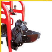
Angle Adjustable Footplates