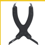
Poziform Contoured Chest Harness