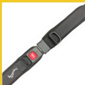
Poziform Padded Pelvic Belt