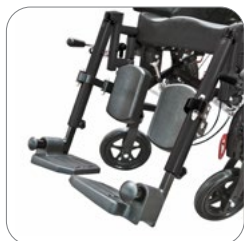
Adult Elevating Legrests