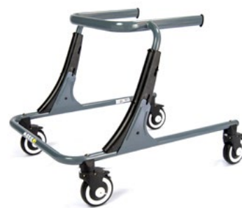
Sword Gray (available in Large Only)