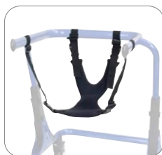
Soft Seat Harness