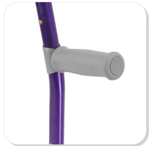
Smooth Hand Grips for Comfort