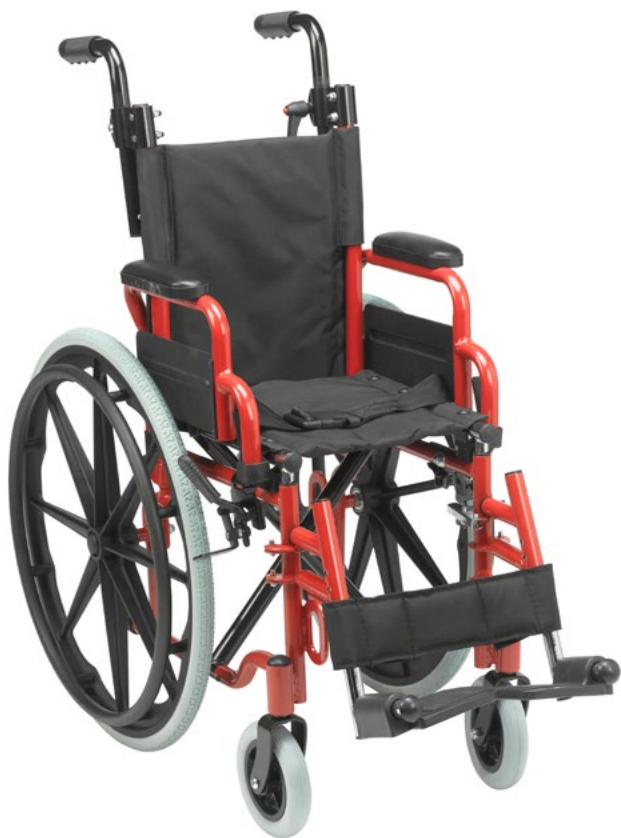
12" W wheelchair only available in Red