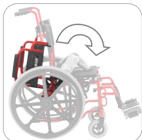
Flip-Back Padded Desk Length Arms