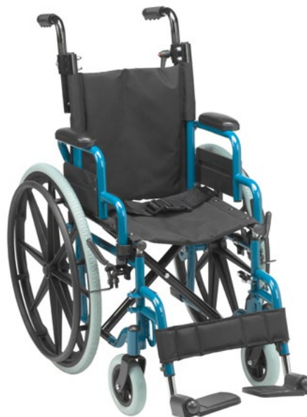
14" W wheelchair only available in Blue