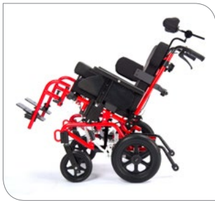
Tilt & Recline

For children and young adults in need of minimal to moderate support, The Kanga wheelchair offers tilt-in-space adjustability to maintain a proper sitting posture. The Kanga wheelchair grows from 10" to 14" width and offers 45° of tilt for pressure relief and gravity assisted positioning. For use with Inspired by Drive newly available complex rehab seating option. Also accommodates other manufacturer's seating.