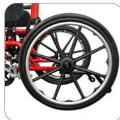
20" Rear Wheel Assembly