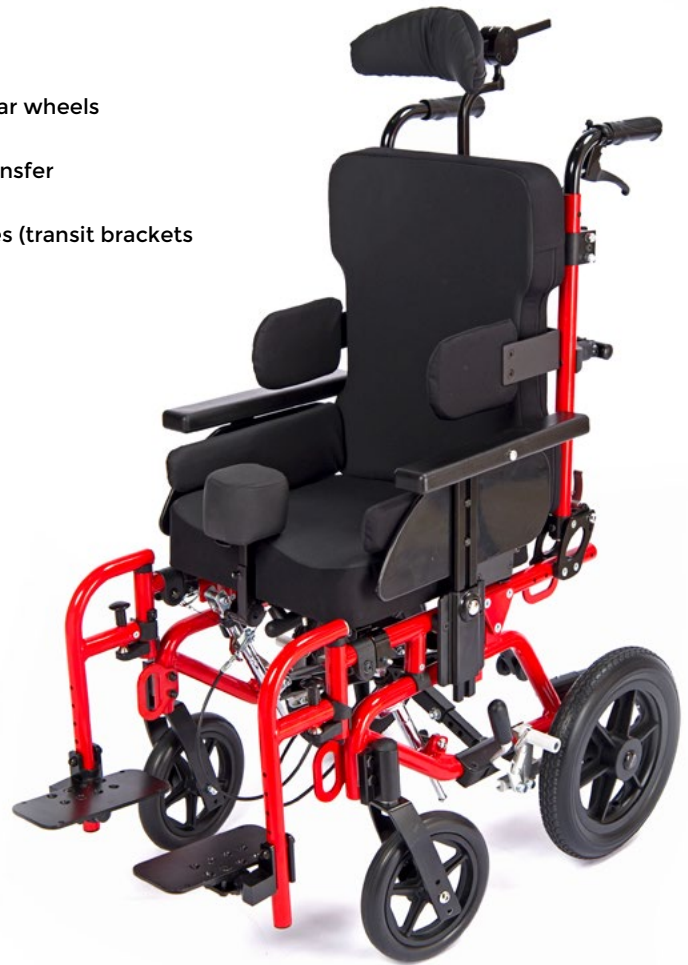
Seating system sold separately