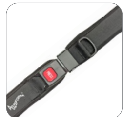
Poziform Padded Pelvic Belt