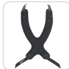
Poziform Contoured Chest Harness