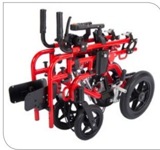
Folds for Easy Transport