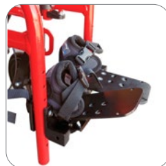
Angle Adjustable Footplates