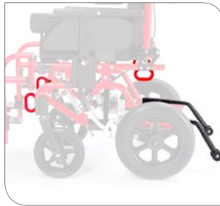
Standard Transit Brackets & Anti-Tipper