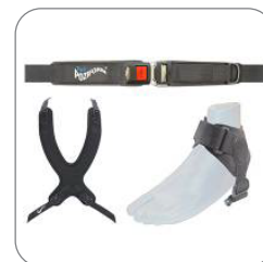
Poziform Belts & Harnesses