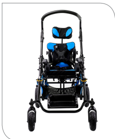
Jet Fighter Blue