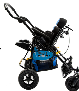
Forward and Rear Facing Seating