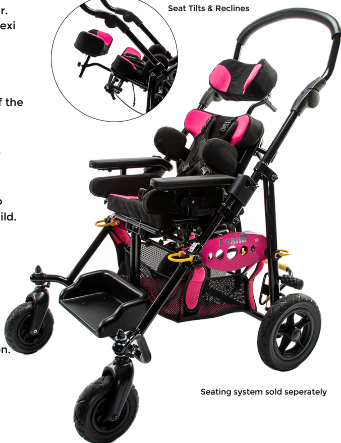
Seating system sold separately