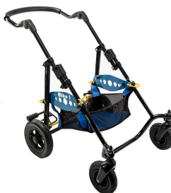
Frame folded for easy transport and storage