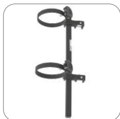
Oxygen Tank Holder