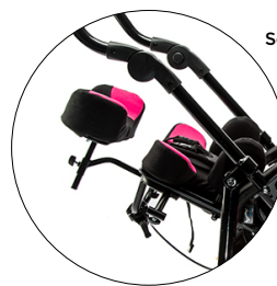
Seat Tilts & Reclines