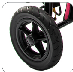
All Terrain Rear Wheel