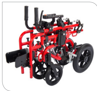
Folds for Easy Transport