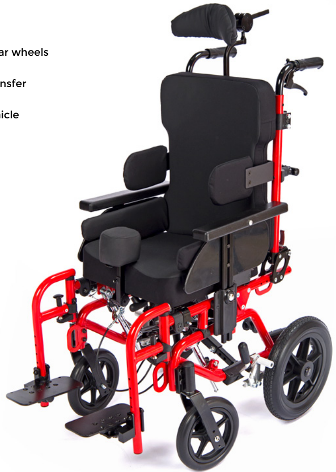
Seating system sold separately