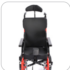
Rehab Style Seating System