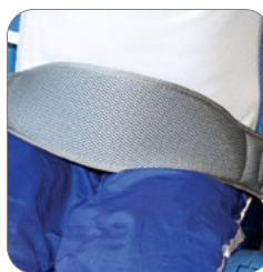
Rapid Dry Positioning Belt