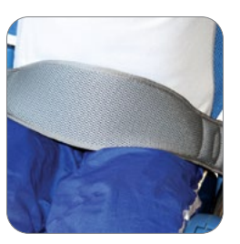
Rapid Dry Positioning Belt