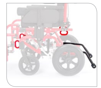
Standard Transit Brackets & Anti-Tipper