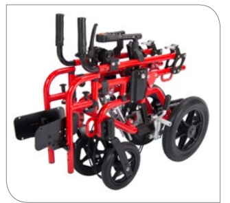
Folds for Easy Transport