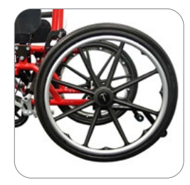
20" Rear Wheel Assembly