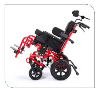
Tilt & Recline