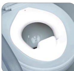
Plastic Reducer Ring