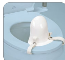
Soft-Flex Splash Guard