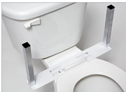
U-Shape Mounting Base allows you to upgrade or replace the support back to the next size for a fraction of the cost