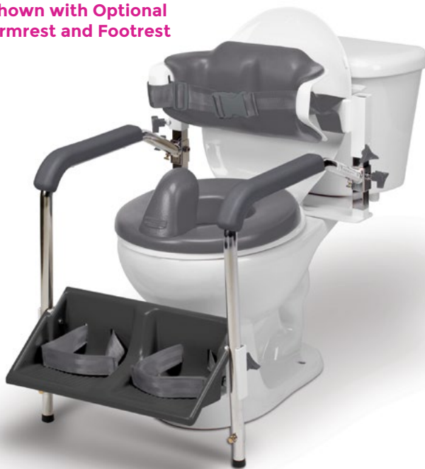
Shown with Optional Armrest and Footrest