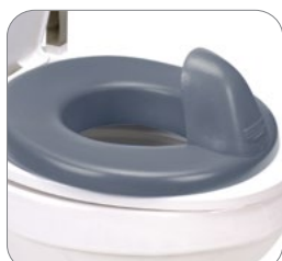
Padded Reducer Ring