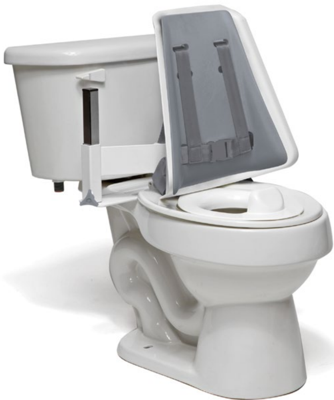
Shown with Reducer Ring