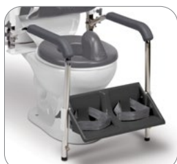
Armrest & Footrest