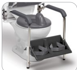
Armrest & Footrest