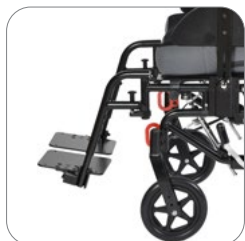
70° Footrests, Adjustable Angle Footplates