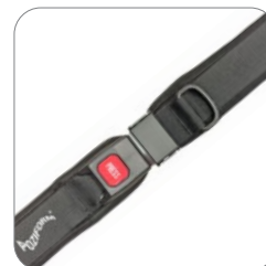
Padded Center Pull Pelvic Belt