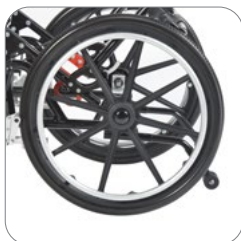
12" Rear Wheel Assembly