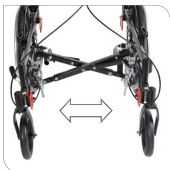
Adjustable Width Crossbrace