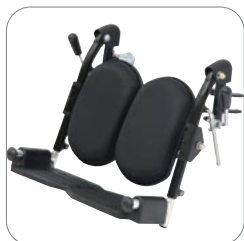
Adult Elevating Legrests