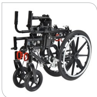
Folds for Easy Transport