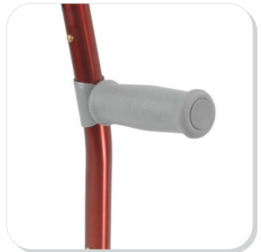
Smooth Hand Grips for Comfort