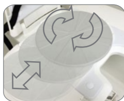
Swivel and Transfer Aid