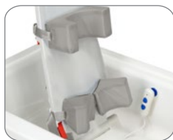
Head and Trunk Support Pads