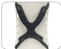
Contoured Chest Harness