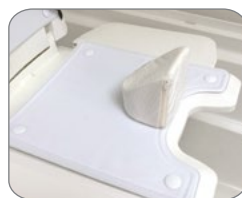
Abductor with Non-Slip Seat/Back Covers