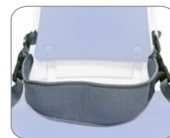
Rapid-Dry Pelvic Positioning Belt