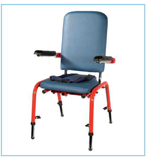
Item # FC 2000N