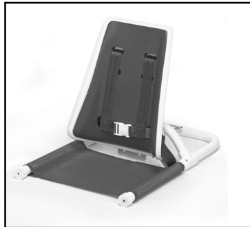
Hi-Back with Padding