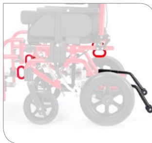
Standard Transit Brackets & Anti-Tipper