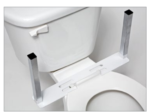
U-Shape Mounting Base allows you to upgrade or replace the support back to the next size for a fraction of the cost