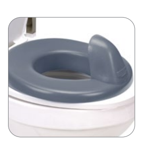
Padded Reducer Ring