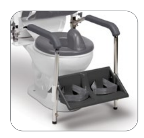
Armrest & Footrest