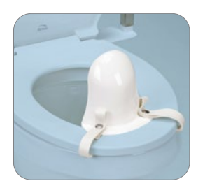
Soft-Flex Splash Guard