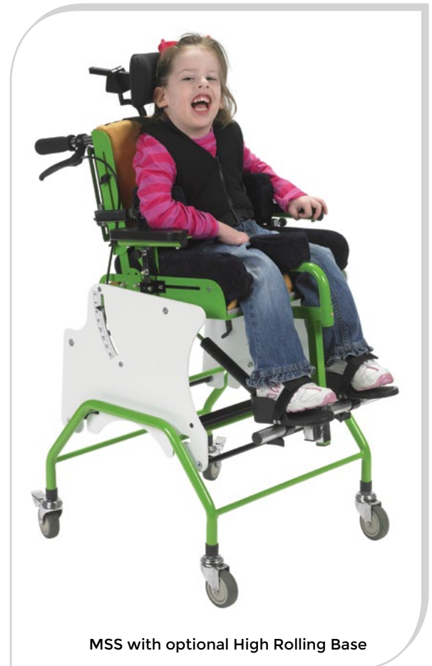
MSS with optional High Rolling Base