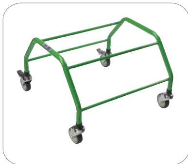
High Rolling Base